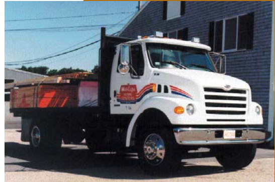
Mid-Cape's delivery fleet serves a largely contractor customer base.